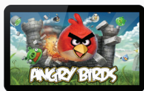
High Quality Touch Screen

The i DISPLAY Retail Tablet L is an Android based, interactive digital display which is specifically built for retail and is the first retail tablet at this unique size. The i Display Retail Tablet is a robust yet slimline unit that features a high quality 15.6" touch screen integrated within tempered glass to ensure durability and effectiveness. The embedded Wi-Fi enables remote automatic connection to content management system (CMS). i DISPLAY Retail Tablet L software and hardware have been designed for commercial and retail use and include important features such as content auto-play, auto-copy, auto-detect and password protection functionalities. A VESA mounting system on the back enables various mounting solutions for the retail environment. Setting buttons and sockets are placed at the back of the device to prevent customers from modifying the preferred settings. The i DISPLAY Retail Tablet L can connect to external hardware such as a coupon printer, barcode scanner and can run a multitude of Android applications to reinforce marketing messages and promotions within the retail space. The i DISPLAY Retail Tablet L offers the ability to work in either landscape or portrait mode, comes with a variety of fixtures, and is the ideal digital point of sale display for retailers looking for an affordable large sized interactive digital signage solution!