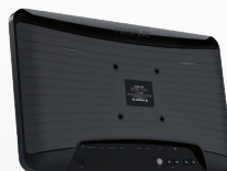
Built for Retail