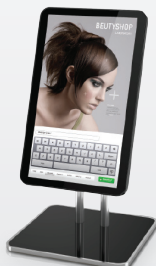
Variety of Fixtures