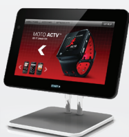
Variety of Fixtures