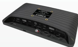
Built for Retail