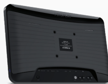
Built for Retail